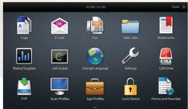
User friendly 7" tablet-style touch screen display.