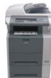
HP LaserJet M3035xs MFP (CB415A)

All the features of the base model, plus: