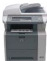
HP LaserJet M3035 MFP (CB414A)