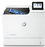
HP Color LaserJet Managed E65060dn