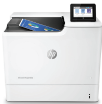
HP Color LaserJet Managed E65060dn

HP Managed MFPs are optimized for managed environments. Offering increased monthly page volumes and fewer interventions, this product can help reduce printing and copying costs. See your HP Authorized Reseller for details.