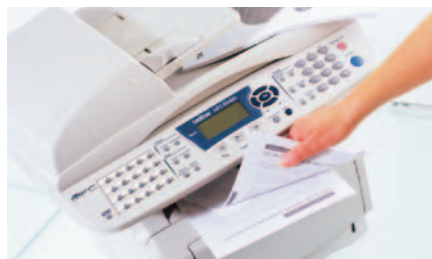
Duplex printing as standard (Only MFC-8840D) Ready to duplex straight from the box