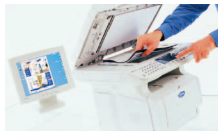
Flatbed scanning For easy scanning of bound documents