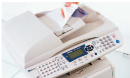
Laser faxing In as little as two seconds per page