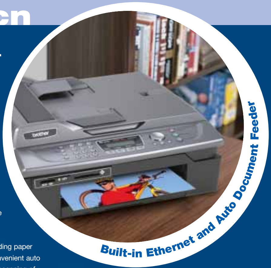
Built-in Ethernet and Auto Document Feeder

And when you connect it to your home network, you can quickly and efficiently share its features with every connected Windows® PC or Mac® user in your household.